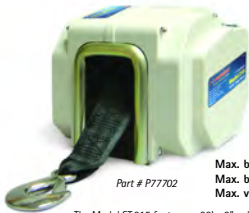
Part # P77702

Strap winches are strong, yet easier to work and easier on the hands than cables.