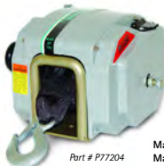
Part # P77204

The Model ST 215 features a 20' x 2" polyester strap and power-in/freewheel-out operation. The Model ST 215's reliable spur-gear system provides more powerful pull with less amperage draw. Rugged ABS weather-resistant housing for the toughest environments. Positive Lock prevents unwanted strap slippage. Fast, easy installation and a one year limited warranty. Accessories not shown include a 30 amp circuit breaker, trailer mounting hardware, emergency hand crank, color-coded wiring harness and a 25 foot lanyard for operating the winch.